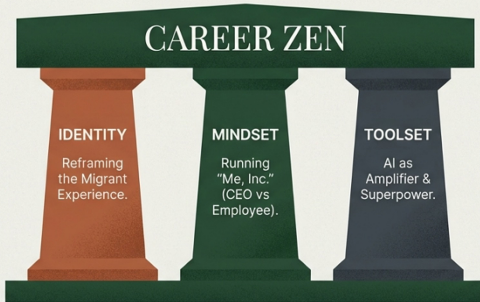
The Golden Triad